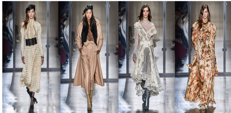
NYFW: ZIMMERMANN A /W 2019/psum