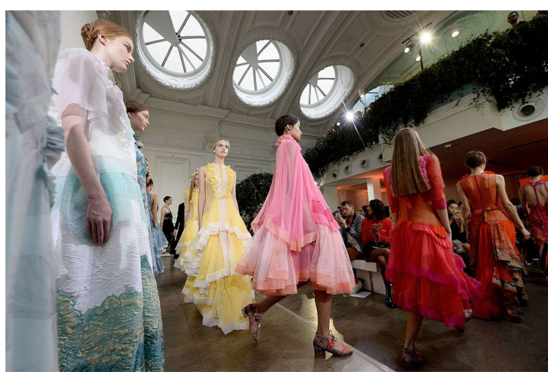
Fashion dress color tune