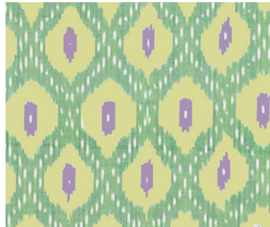
5. split complementary