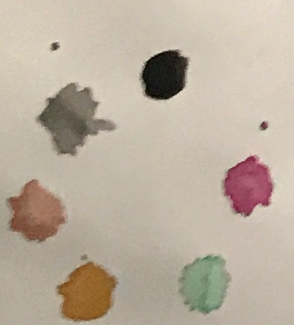
COLORS I LIKE