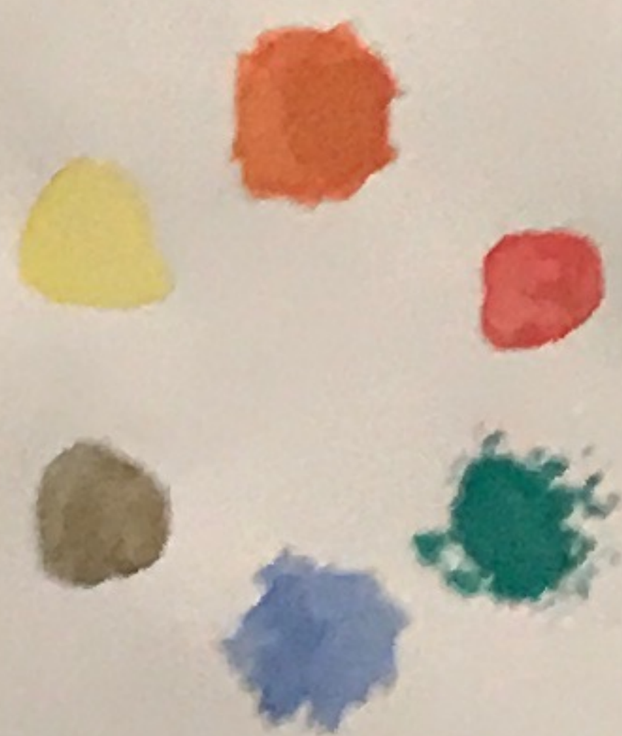
COLORS I DISLIKE