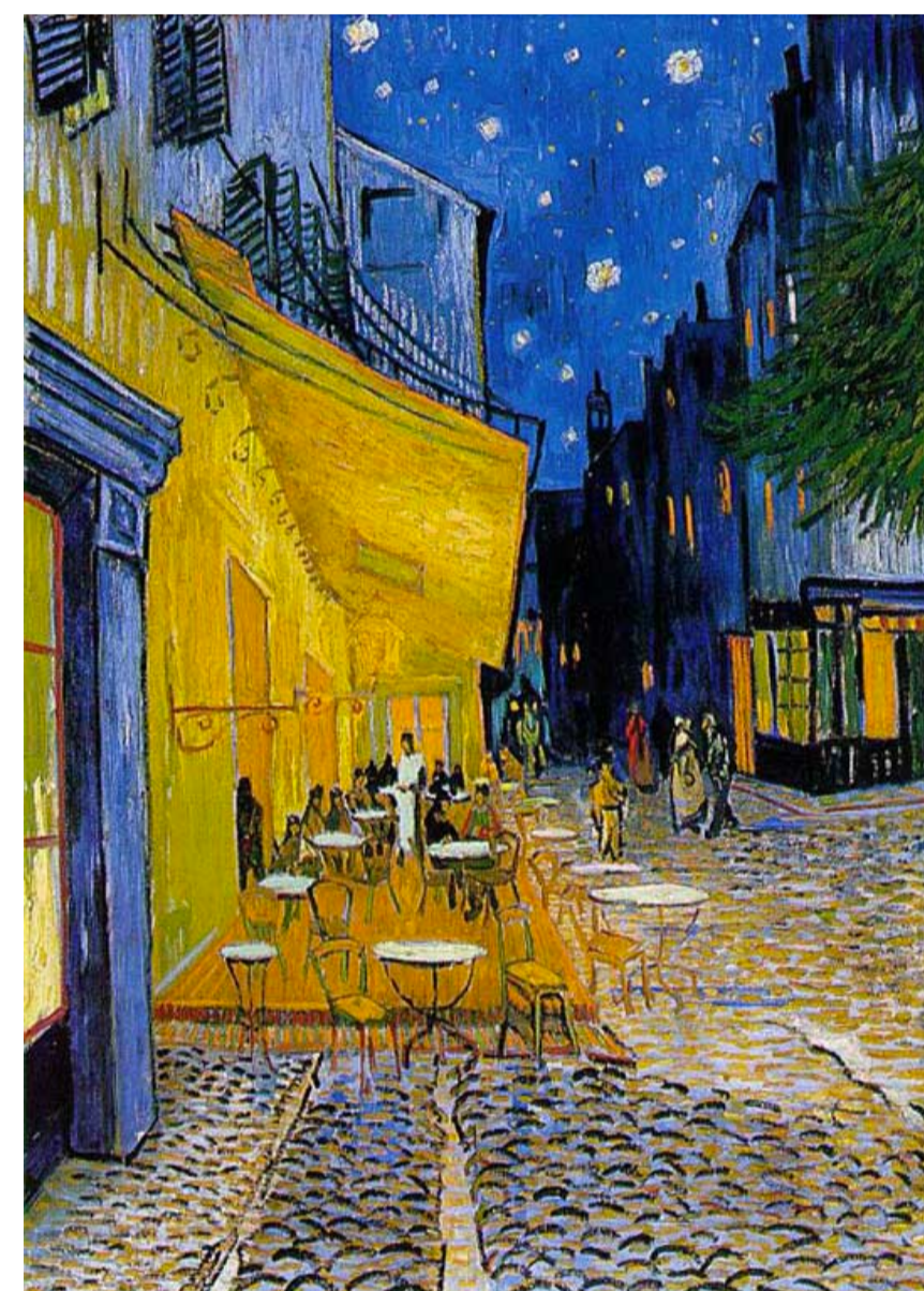
Inspired by Vincent Van Gogh Cafe Terrace on the Place du Forum, Arles (1888)