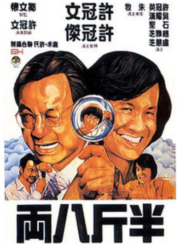
The Private Eyes

The martial arts films starred by Bruce Lee, including the 1971 The Big Boss and Fist of Fury the following year, were sensational. Cornered for some times by Western and Mandarin films, Cantonese films were much revived in the 1970s, with the great success of 1976 The Private Eyes , directed by Michael Hui, which is said to remain the all-time box-office king of Hong Kong cinema when inflation is taken into account.