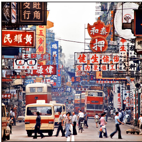
MongKok Hong Kong 1976. The word "Mong" in Cantonese stand for busy, "Kok" stand for conner.