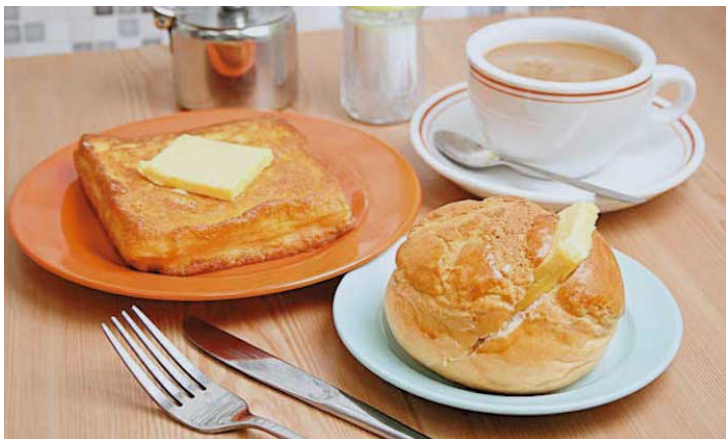
Milk Tea, Pineapple Bun and Hong Kong Style French Toast. The symbol of British and Eastern Culture.

A cha chaan teng (literally: ‘tea restaurant’) is a type of restaurant commonly found in Hong Kong, Macau and parts of Guangdong. They are known for eclectic and affordable menus, which include dishes from Hong Kong cuisine and Hong Kong-style Western cuisine.[1] Since the mass migration of Hong Kong people in the 1980s, they have also been commonplace in many Western countries like Australia, Canada, the United Kingdom and the United States, particularly in the Chinatown areas of many major cities. They are often called Hong Kong Style Cafe in English, due to the casual setting as well as coffee & tea being central to the menu.