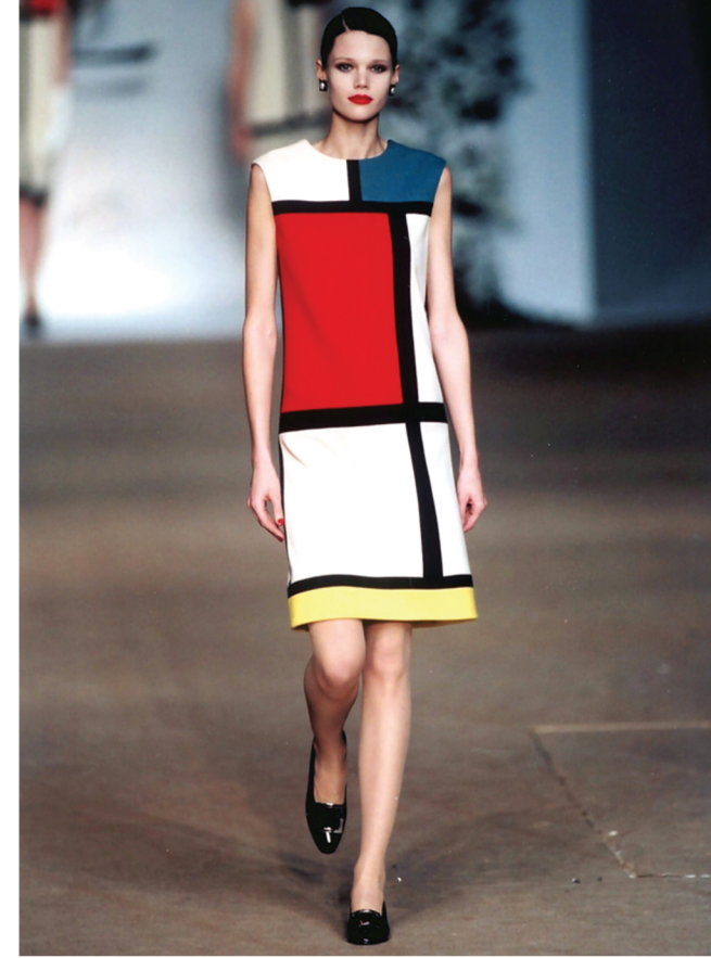
Pyer Moss s/s 2019