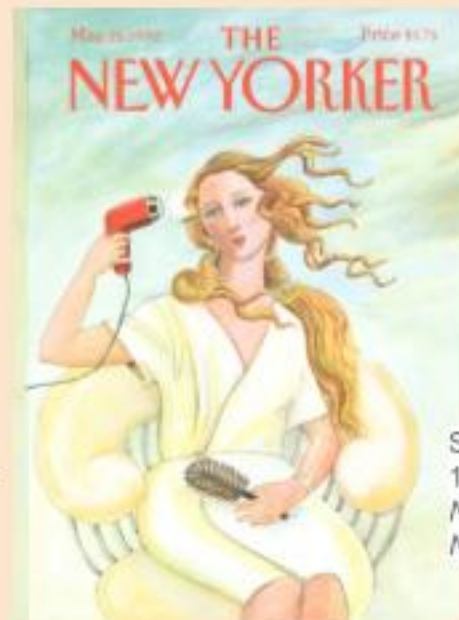
Susan Davis, May 25, 1992 , 1992.