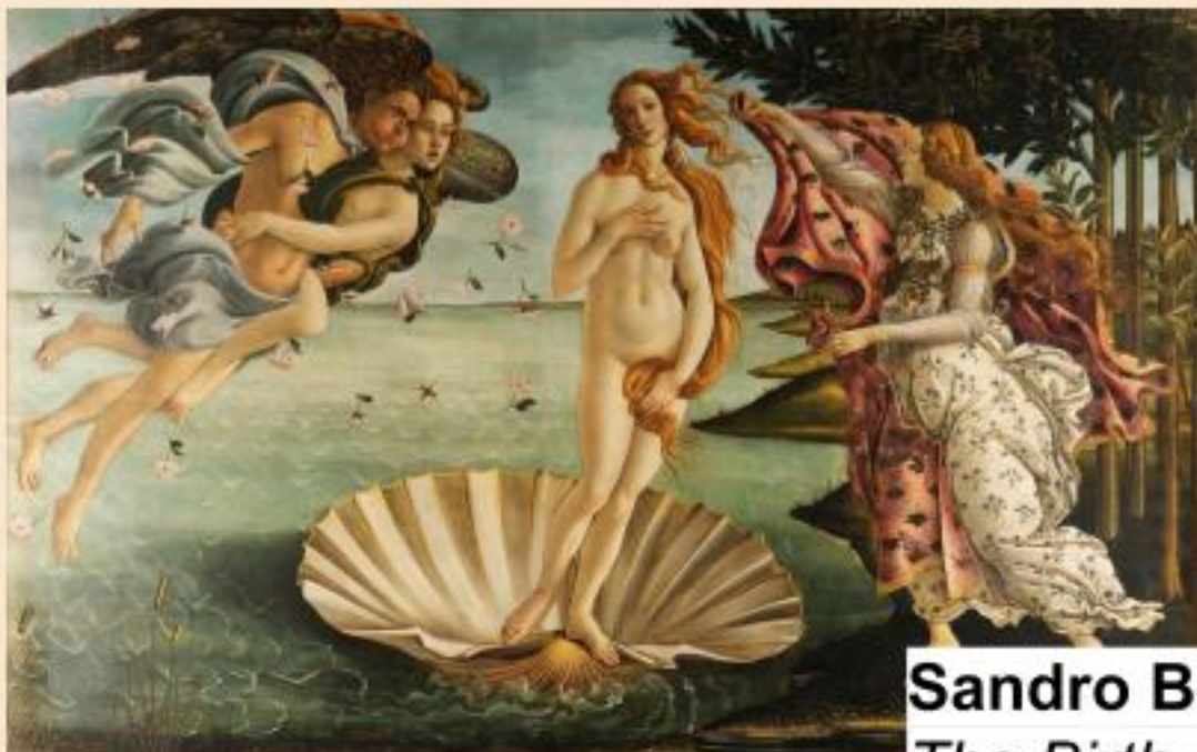
Sandro Botticelli The Birth of Venus , ca. 1486 Uffizi Gallery, Florence